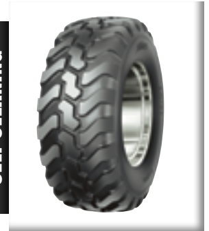
On / Off Road / Industrial Tires