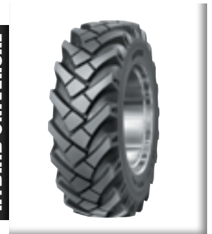
On / Off Road Tires

Mustang reminds users to read and understand the operator's manual before operating any equipment. Also, make sure all safety devices and shields are in place and functioning properly.